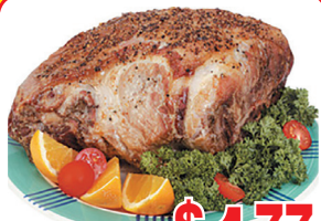
Fresh Whole Boston Butt