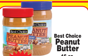
Best Choice Peanut Butter 16 oz.

Always Save Grape Jelly 32 oz. 98¢ $1.18