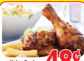
Value Pack Chicken Legs