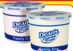
Dean's Ice Cream 4.5 qt. pail