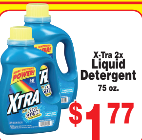
X-Tra 2x Liquid Detergent 75 oz.